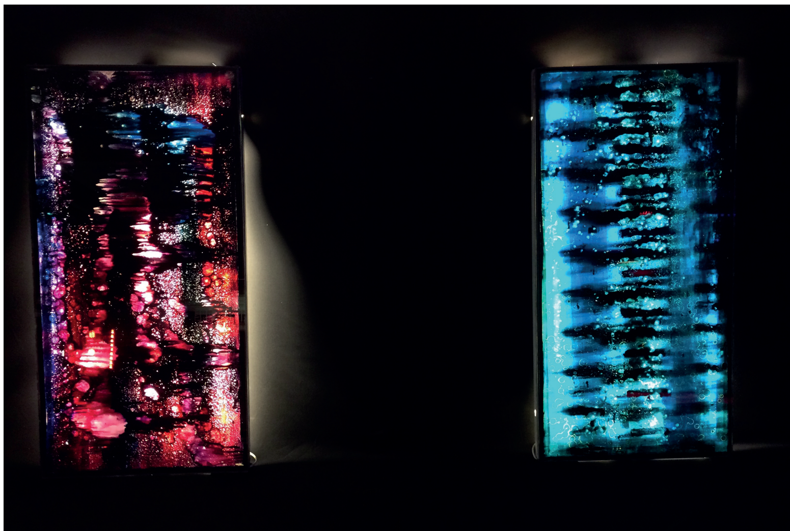
HILTON III & IV 91 x 46cm mixed media 2017