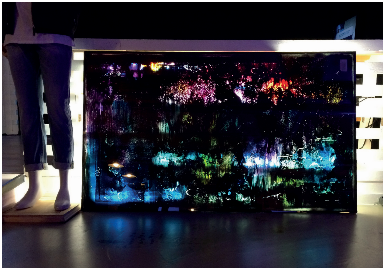
Edwin III 91 x 156cm mixed media 2017