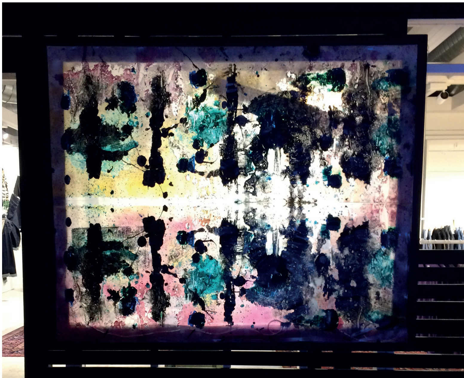
Edwin 290 x 300cm mixed media 2017