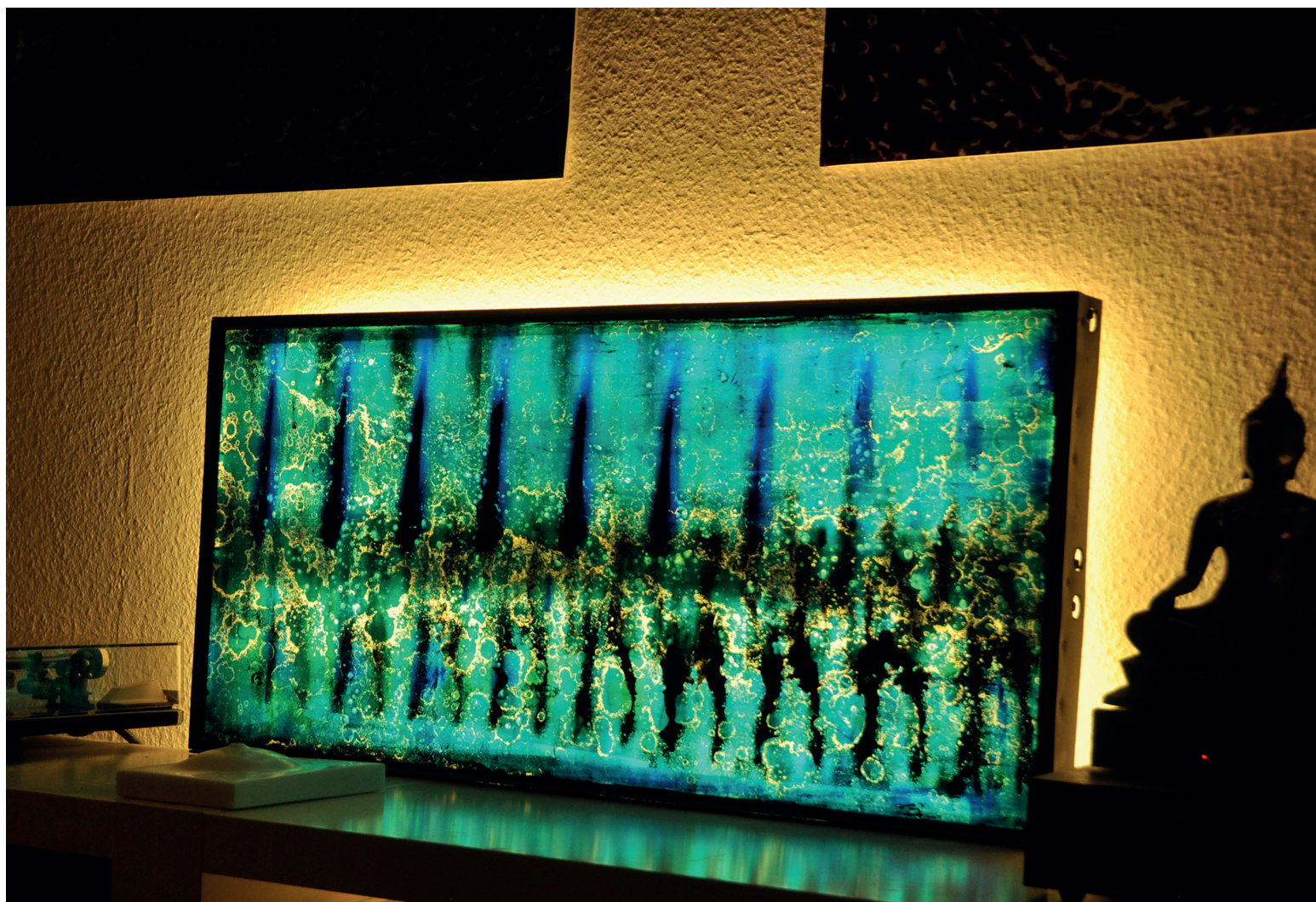
HILTON I 91 x 46cm mixed media 2016